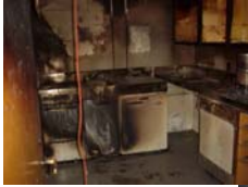
Immediate Fire Area