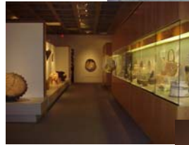
The Building Designed by I.M Pei