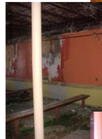
Sorting through the Damage from the loss